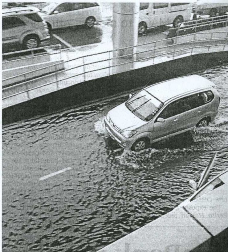
Penang International Airport's arrival hall driveway was flooded after heavy rain yesterday.

In September, many passengers had to wade in ankle-deep water at the airport.